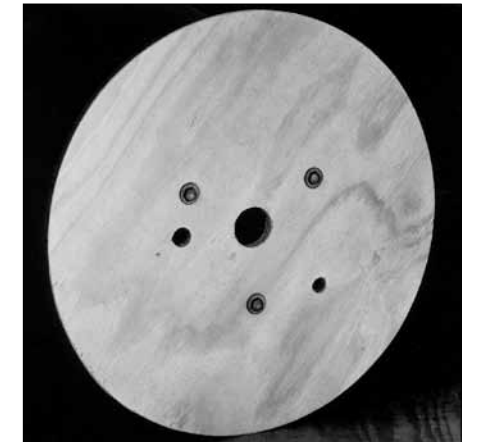
All borings are produced to your precise specifications.